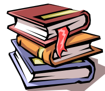
Table Quiz Nights 3 rd Friday of every month

The quiz nights continue to go along successfully. Please make every effort to provide your support.